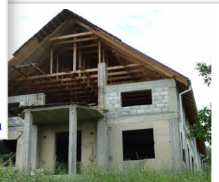
Ford's church plant construction

town in front of cafes and restaurants, and people will spend more time outside talking. This results in great opportunities to get to know more people and share the Gospel. After our language progress in the past year, we